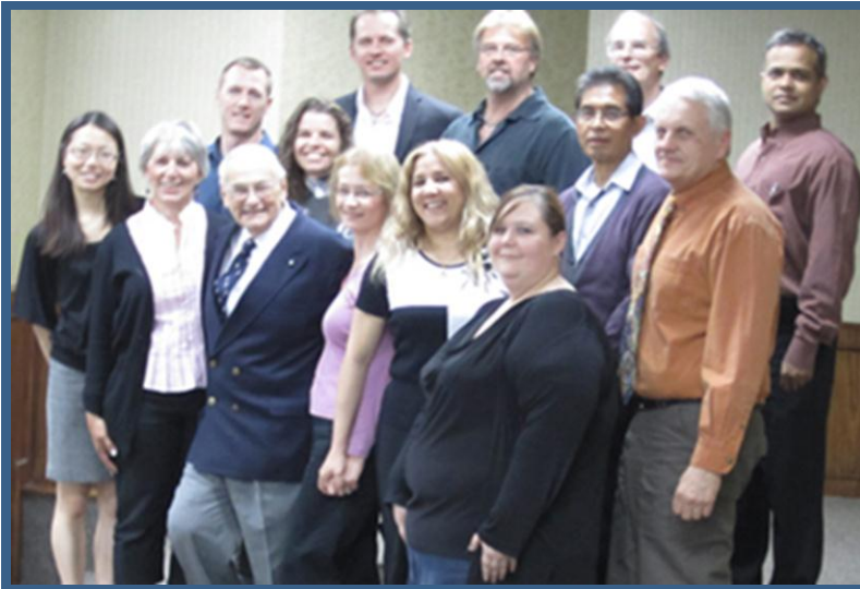
Southern Lights Toastmasters Family